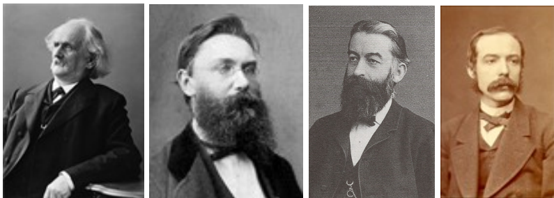
Former seminar students Carl Neumann, Alfred Clebsch, Oskar Emil Meyer, Georg Hermann Quincke.