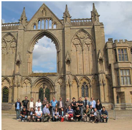
A group picture from the workshop, taken at Newstead Abbey

The workshop, mainly funded under the European Science Foundation Exploratory Workshop framework, aimed at establishing an all-European platform to explore the interplay between quantumness and complexity, and more broadly the border between the classical and the quantum world. By complex systems we classified biological, many-body, hybrid, disordered, and meso/macrosopic systems. By manifestations of quantumness we instead identified coherence, entanglement, non-classical correlations (quantum discord), non-locality, and information processing applications. The selection of speakers was made in such a way that each participant’s recent research was identifiable with one or more crossroads among the above topics. A number of fundamental questions with technological impact were raised: What is the most essential signature of quantumness? Is quantum theory the only one able to explain experiments at the microscopic scale? To what extent quantum effects are manifest and play central roles in complex, many-body and macroscopic systems? What still unexplored possibilities are allowed by quantum laws and general types of quantum correlations for empowered quantum information processing and communication? The goal of the workshop was to gather a top-notch community of theorists and experimentalists to define the state of the art and future directions in this emerging area.